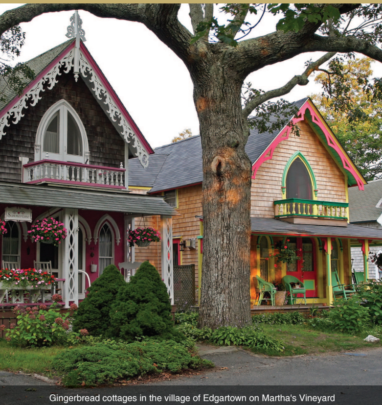
Gingerbread cottages in the village of Edgartown on Martha's Vineyard