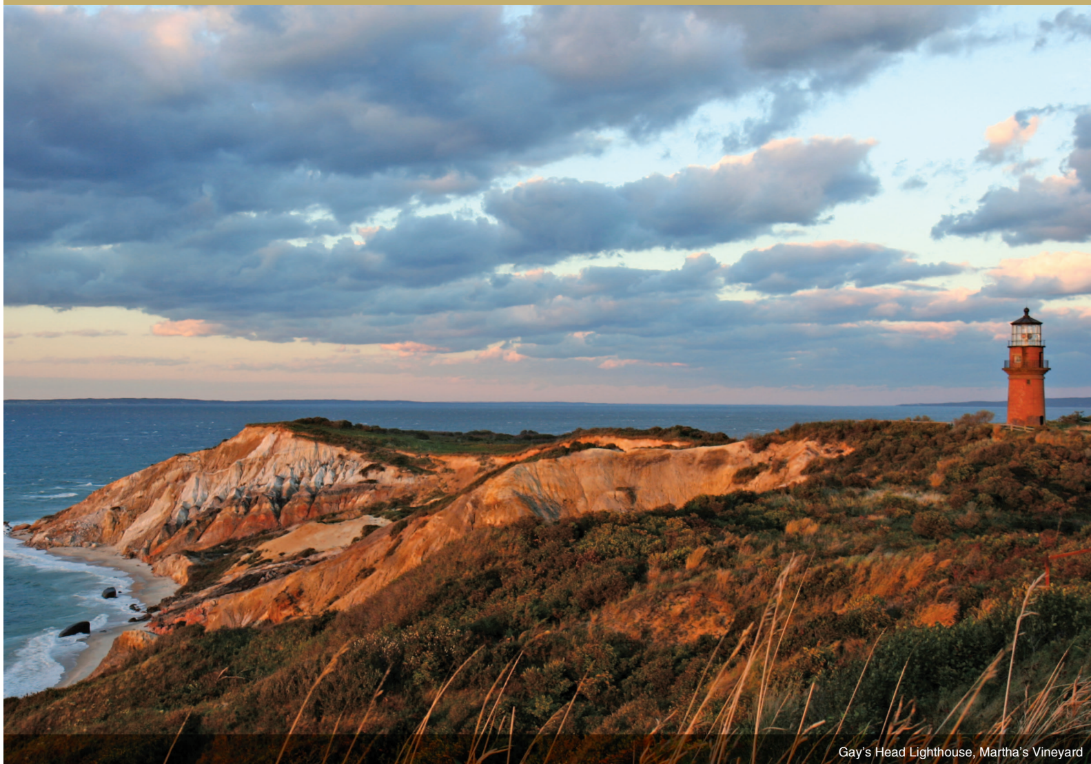
Gay's Head Lighthouse, Martha's Vineyard