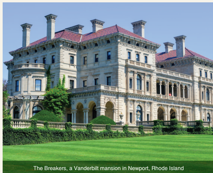
The Breakers, a Vanderbilt mansion in Newport, Rhode Island

After breakfast, your group transfer brings you to Boston’s Logan Airport for flights out after 1:00 p.m. Meal: B